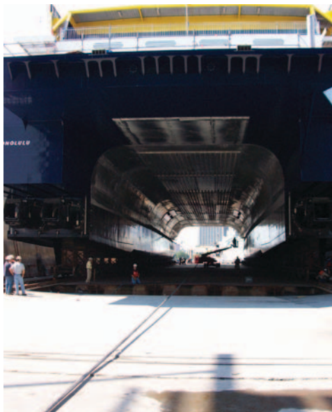
Turbo-75 provides tension to prevent a spontaneous launch.