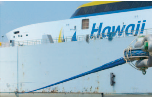
AmSteel®-Blue holdback lines keep the drydock in position, while the winch lines pull the ferry aboard.