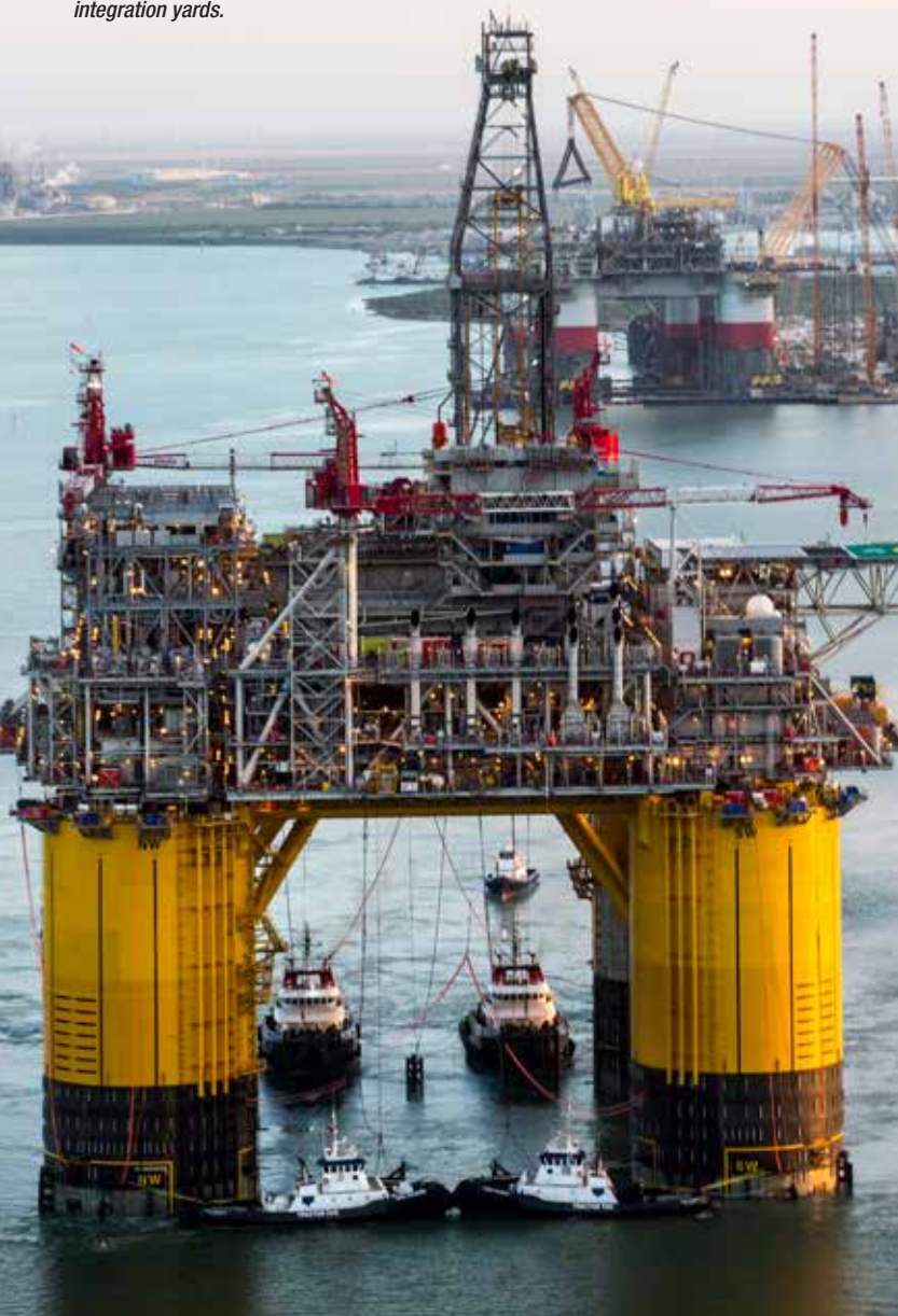
Underway from the integration yards.