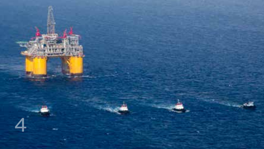
The offshore portion of the tow-out.

Once the rig was clear of the channel and in open water, the tugs were repositioned in the offshore tow configuration. Again, an easy changeover without the need for additional equipment was critical. Rigging in open water can be challenging, but lightweight, high-performance synthetics that are easily handled by manpower alone made rigging changeovers quick and efficient.