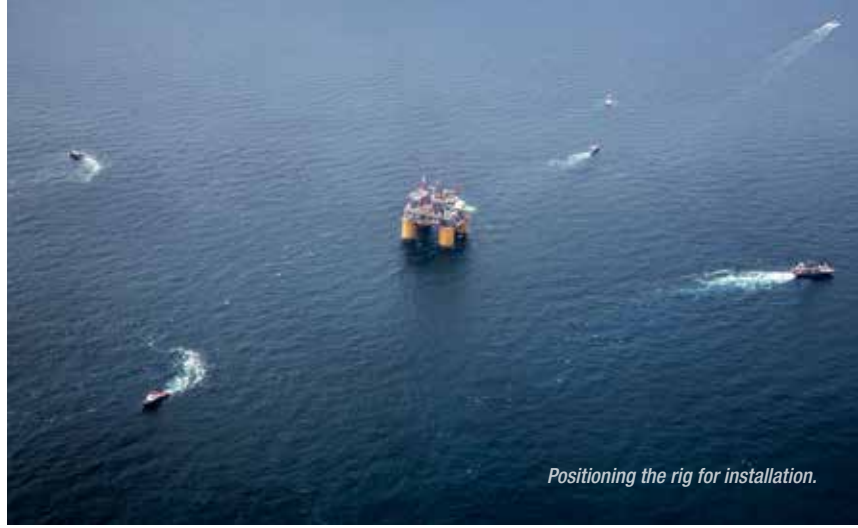
Positioning the rig for installation.

With the installation now complete, the lines have been returned to the SWOS facility in Houston. They have been fully inspected, proof loaded, and recertified, and are being stored in controlled conditions, ready for use on the next Shell project.