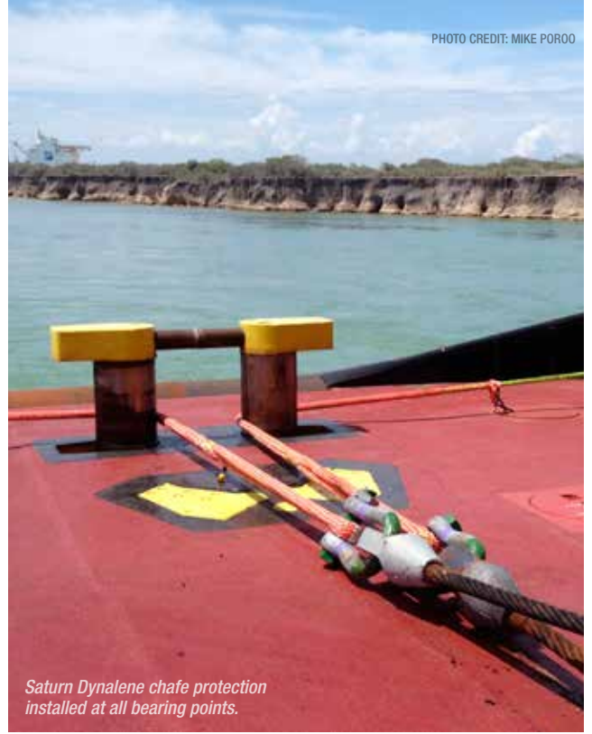
Saturn Dynalene chafe protection installed at all bearing points.

The reduction in installation time was due to the simplicity of the connection—lugs vs. a padeye/shackle/shear pin system required by steel-wire rope. The total number of fittings was reduced, along with the elimination of additional steel-wire ropes required just to handle the fittings.