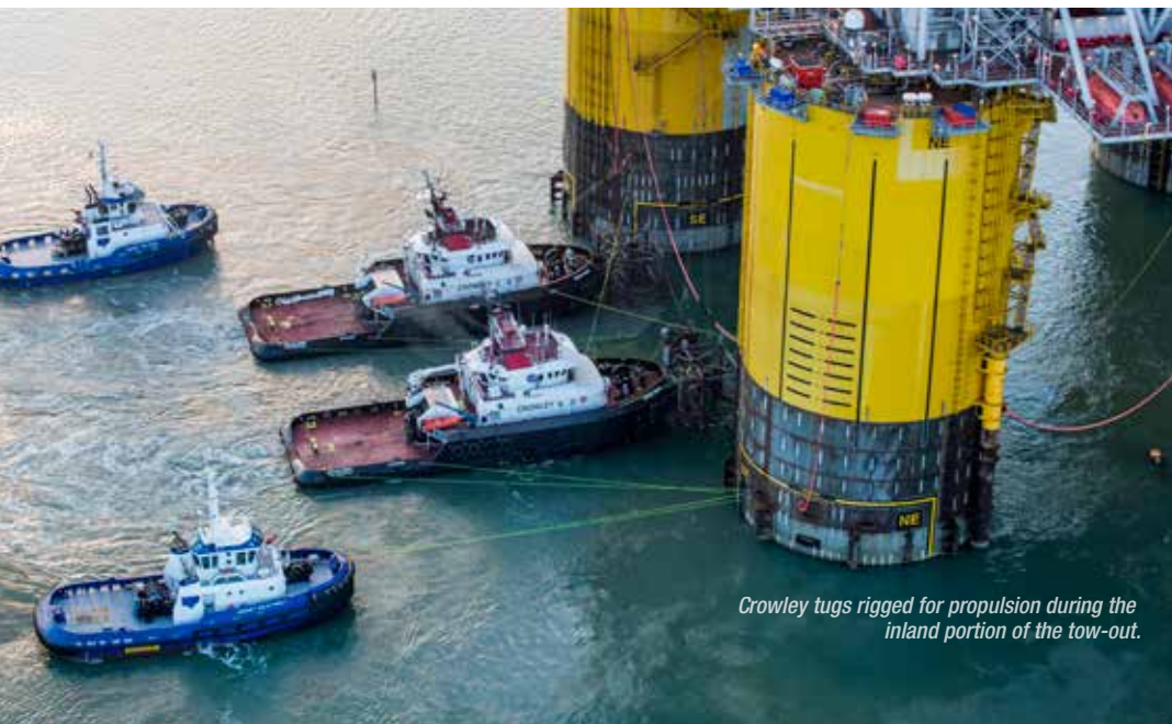
Crowley tugs rigged for propulsion during the inland portion of the tow-out.

Shell's First Use of Synthetic Rigging Results in Operational and HSSE Benefits