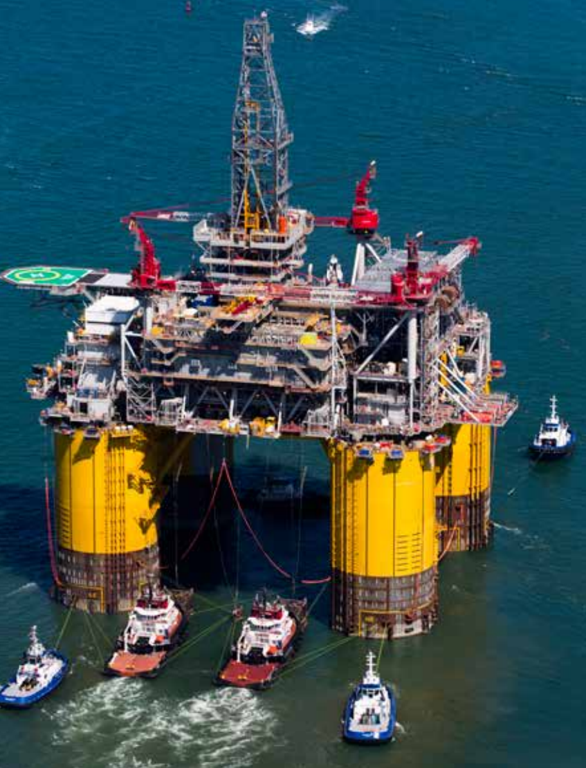
Inshore rigging configuration.

Once the rig was clear of the channel and in open water, the tugs were repositioned in the offshore tow configuration. Again, an easy changeover without the need for additional equipment was critical. Rigging in open water can be challenging, but lightweight, high-performance synthetics that are easily handled by manpower alone made rigging changeovers quick and efficient.